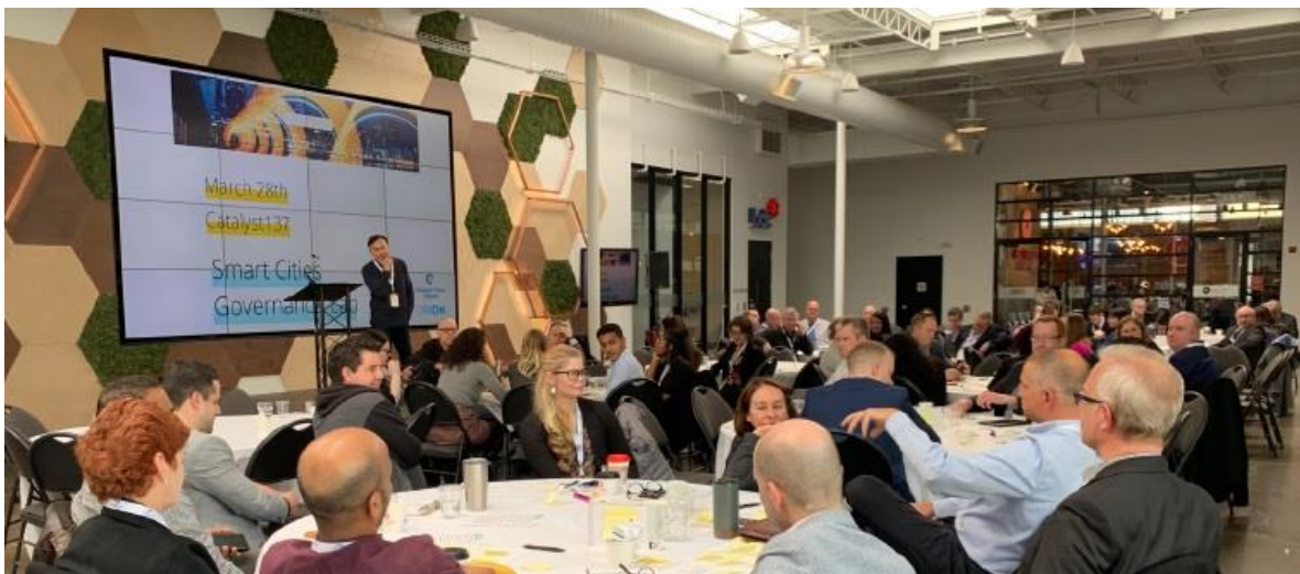
Figure 2. Smart Cities Governance Lab (SCGL), Catalyst 137. Kitchener, Ontario